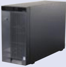
IBM @server xSeries 235