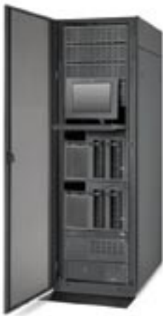
NetBAY42™ Enterprise Rack

“We found IBM’s management suite to be comprehensive, easy to get up to speed on and effortless to administer from. IBM gets an A+ rating for manageability....”