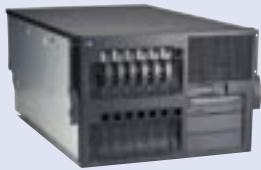
IBM @server xSeries 255

The feature-rich xSeries 235 is a 2-way server using Intel's latest Xeon™ processors and speedy double data rate memory to provide you with power and performance at an affordable price. Offering maximum expandability and flexibility to meet your custom space needs, the x235 comes in both tower models and models that convert to fit neatly into a standard rack to free up precious floor space. X-Architecture features help keep your server available when you need it. And the x235 is the first xSeries server to deliver integrated RAID-1 functionality, which gives you the ability to mirror hard disk drives for data protection—for even higher server availability.