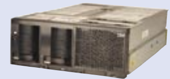
IBM @server xSeries 440

The groundbreaking xSeries 440 exploits the gamut of Enterprise X-Architecture technologies for pay as you grow scalability. This 4U, 8-way system allows you to expand up to 16-way SMP when you are ready, revolutionizing the economics of enterprise computing. Exceptional availability, plus configuration and application flexibility, make it an optimal platform for server consolidation and clustering.